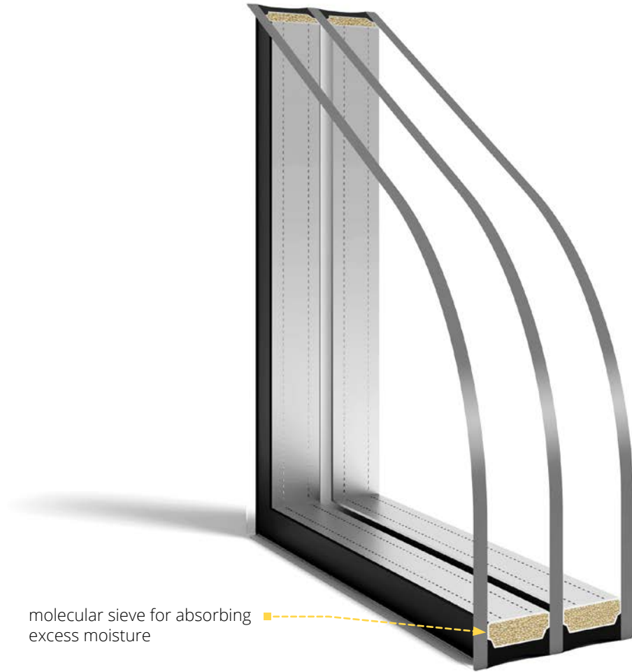
3-pane (2-chamber) 48 mm units with glass-pane spacer made of galvanised steel.